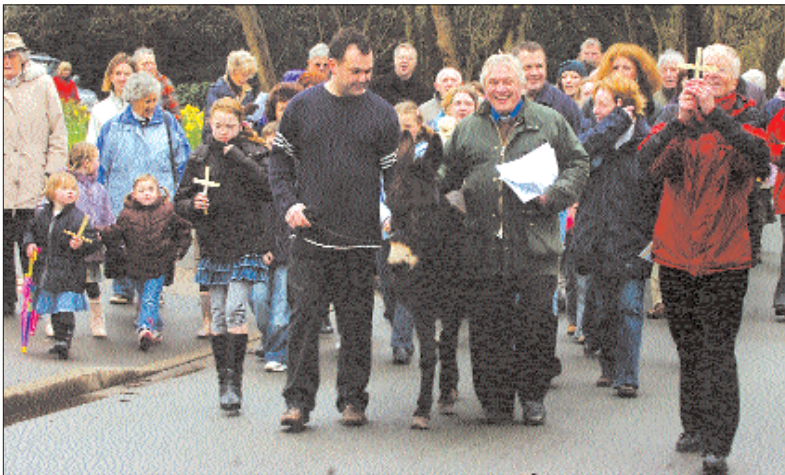
The singing congregation follows Molly the donkey through Kempsey.11338301